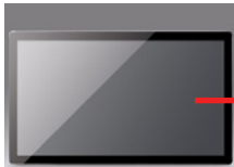
Touch Panel & LCD Display

*Please use only VESA compatible mounting – Detailed floor stand & wall mount datasheet available to download at Advantech website.