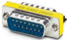
D-SUB contact insert, shell size 2, with 15 signal contacts, contact type pin, gender changer, fixing with 4-40 UNC thread

Please be informed that the data shown in this PDF Document is generated from our Online Catalog. Please find the complete data in the user's documentation. Our General Terms of Use for Downloads are valid ( http://phoenixcontact.com/download )